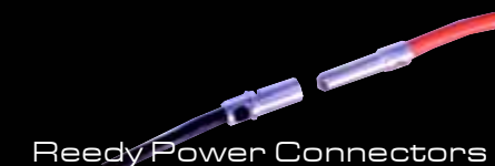
Reedy Power Connectors (5) #652