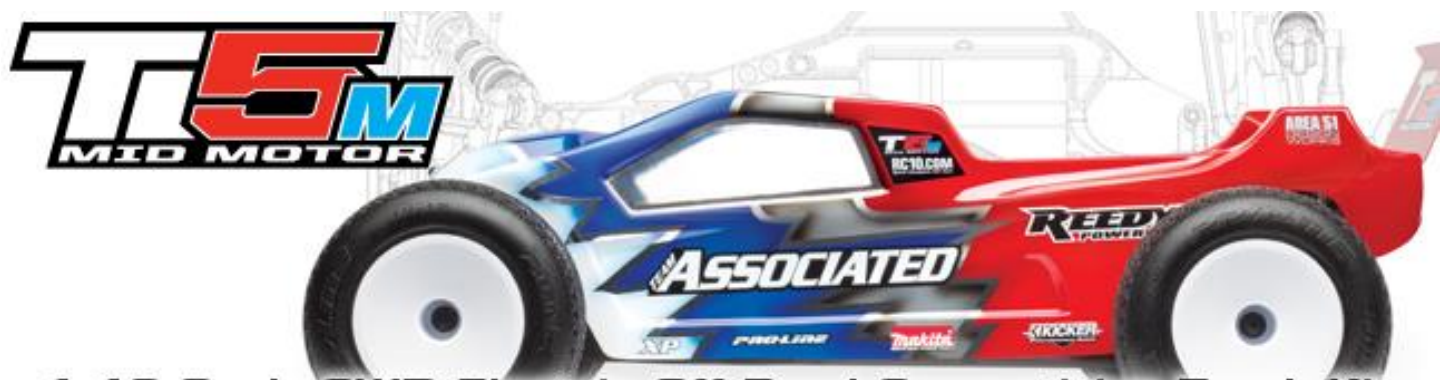
1:10 Scale 2WD Electric Off Road Competition Truck Kit

Since the beginning of the class, Team Associated has been the leader in 1:10 scale 2WD truck racing. Over 24 years have come and gone since the first RC10T made its debut in 1991 and created a winning legacy that continues today in a truck class which is ever evolving.