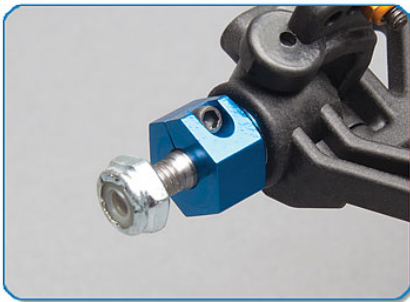
Factory Team 12mm blue aluminum front and rear clamping hexes with hex wheels