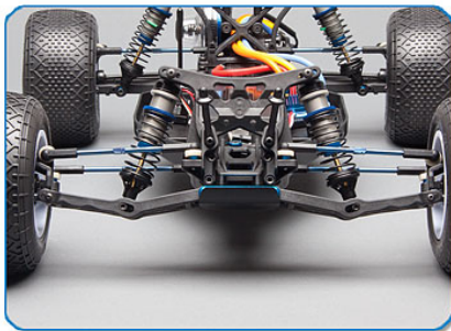
"Gull-wing" front suspension arms and updated shock towers optimized for Big Bore shocks