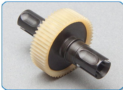
Ball differential with Factory Team light-weight outdrives