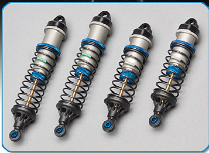
Factory Team 12mm "Big Bore" hard-anodized aluminum threaded shocks