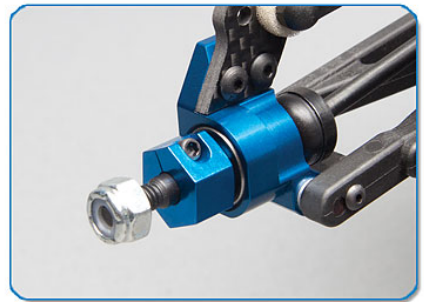
Factory Team 7075-T6 blue aluminum 0° rear hubs with oversized outer bearing