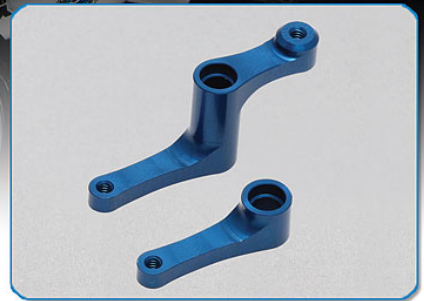
Factory Team blue aluminum bellcrank set