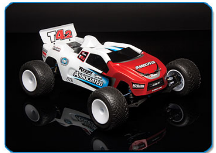
Pro-Line Bulldog body included (unpainted)