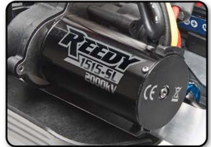
Powerful Reedy 1515-SL 2000kV brushless motor