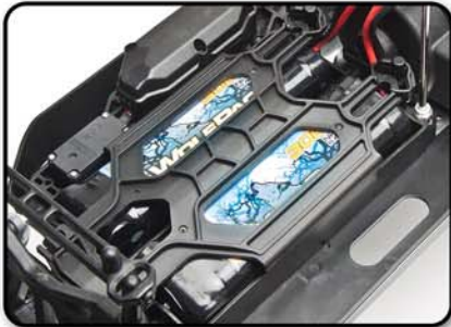
2 Reedy 7-Cell / 8.4V NiMH WolfPack batteries with Deans® Ultra Plugs® included