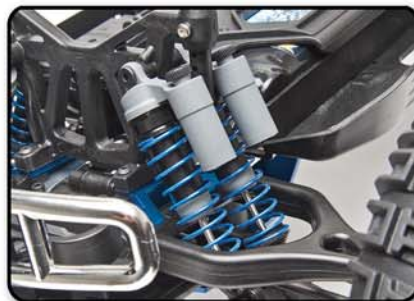
8 adjustable fluid-filled coil-over shocks