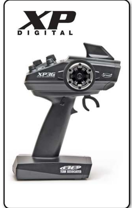
XP 2.4GHz radio system for worry-free operation