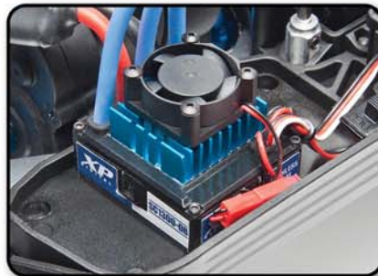
Water resistant XP SC1300-DB brushless ESC with dual Deans® Ultra Plugs®