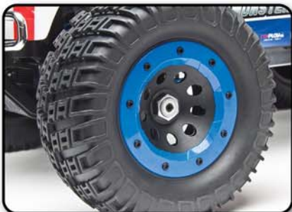
Big aggressive monster truck tires with bead-lock style wheels