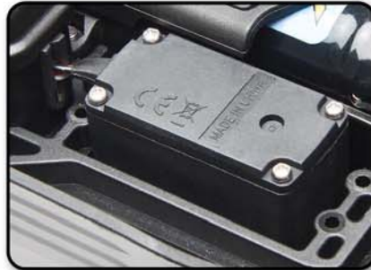
XP metal gear steering servo