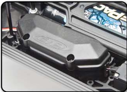
Water resistant enclosed receiver box