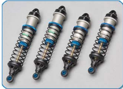
Factory Team 12mm "Big Bore" hard-anodized aluminum threaded shocks