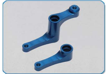
Factory Team blue aluminum bellcrank set