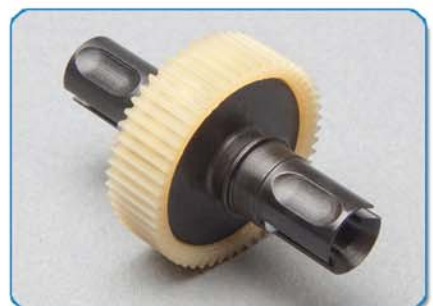
Ball differential with Factory Team light-weight outdrives