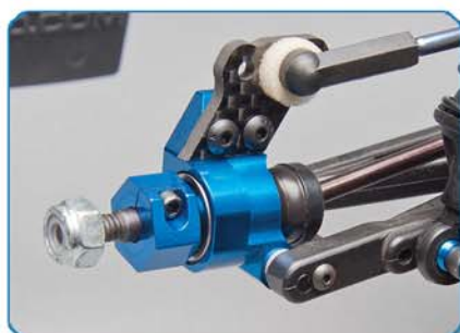
Factory Team 12mm blue aluminum 0° rear hubs with oversized outer bearing and 12mm hex drives