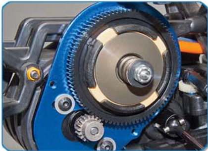
VTS slipper clutch with high-resolution spring for finer adjustment increments