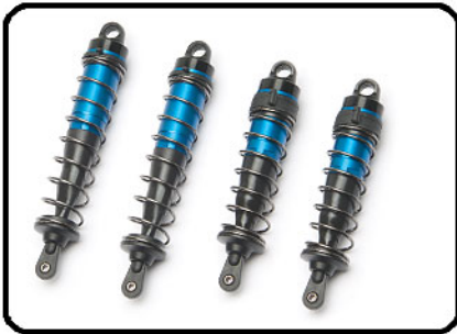
16mm Big Bore 6061 aluminum shock bodies and caps with rubber shock boots