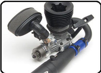
Powerful Reedy .21VS engine with pullstart