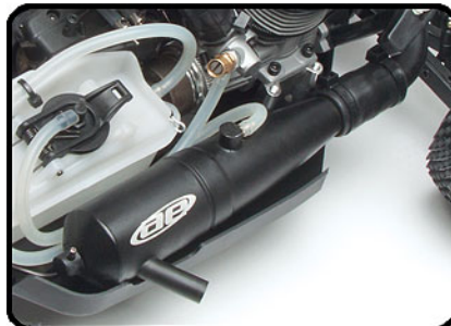
Team Associated 2-chamber tuned exhaust