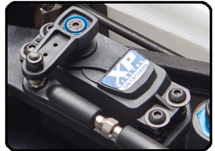
High-torque XP DS1510MG metal gear steering servo