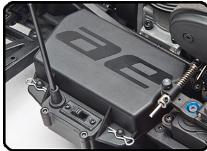
Water-resistant receiver box