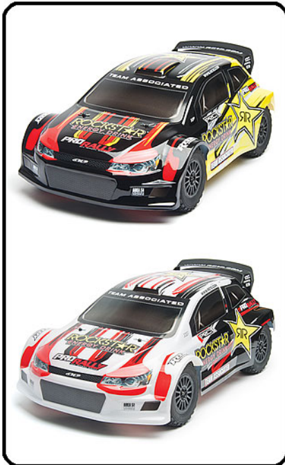
Your choice of two factory-finished Rockstar bodies