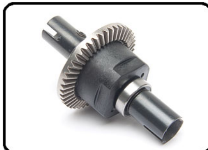
Heavy-duty front and rear gear differentials