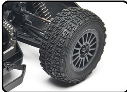
Realistic rally-inspired hex drive wheels with high-grip, all-terrain tires