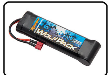
Reedy 7-cell WolfPack battery with high-current T-plug connector