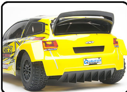
Durable front bumper and rear diffuser