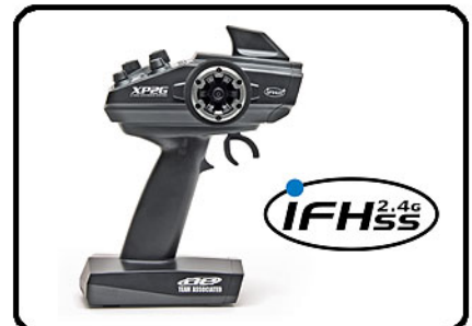
XP2G 2.4GHz radio system