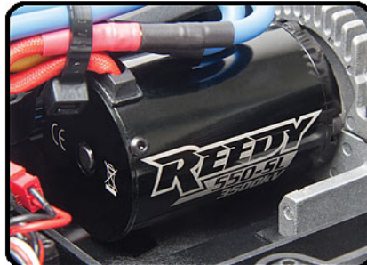
Reedy 550-SL 3500KV brushless motor