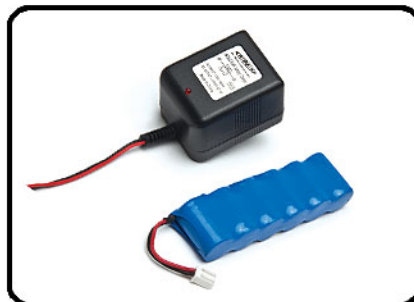
Battery and charger included