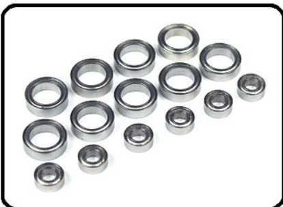
15 precision ball bearing drivetrain