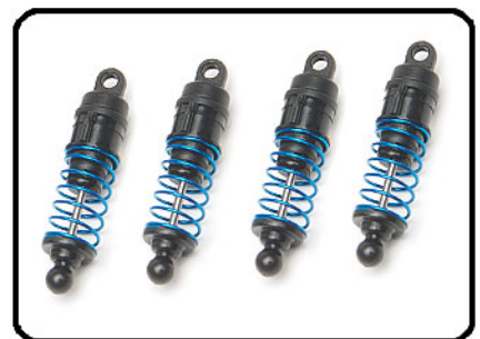
Adjustable, fluid-filled, coil-over shocks