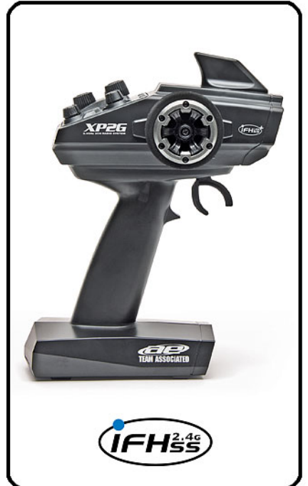
XP 2.4 GHz radio system