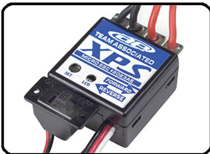
XPS speed control with reverse