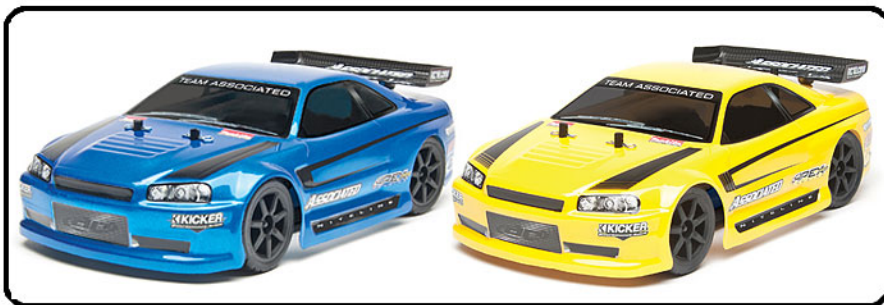
Two factory-finished body color schemes