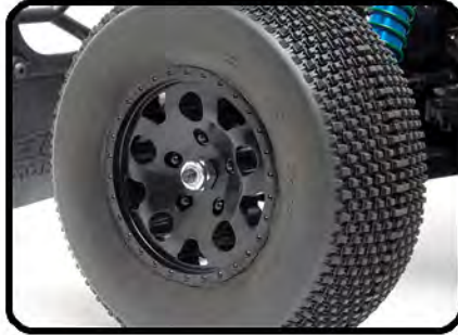
JConcepts rear tires and inserts on KMC® replica wheels