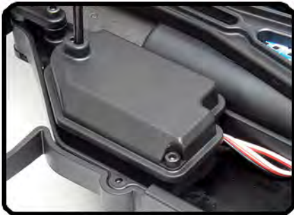
New Water-Resistant enclosed receiver box

R.O.A.R. Short Course National Champion!