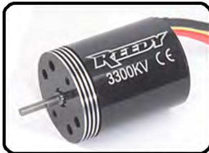
Reedy 3300kV brushless motor