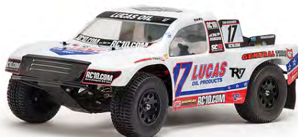
#7046 SC10 RS RTR, Lucas Oil