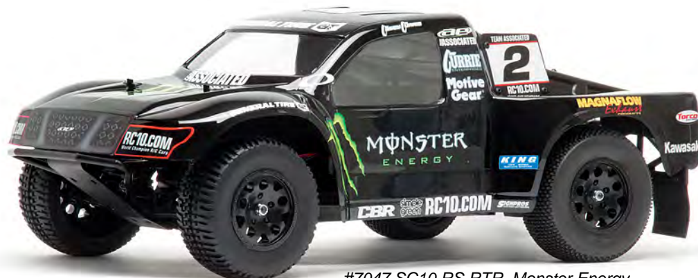
#7047 SC10 RS RTR, Monster Energy