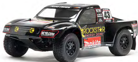
#7049 SC10 RS RTR, Rockstar/Makita

The 2.6:1 ratio gearbox includes a sealed gear differential with new heavy-duty internal gears and the externally adjustable V2 slipper clutch. The new KMC® replica hex-drive wheels come standard on the SC10RS with high traction JConcepts racing compound rear tires and inserts for more grip. The XP3-SS 2.4GHz 3-channel radio system and XP S1903MG metal gear steering servo round out the SC10RS as a potent short course race machine!