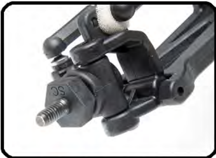
New hex-drive wheels front and rear