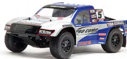
#7048 SC10 RS RTR, Pro Comp