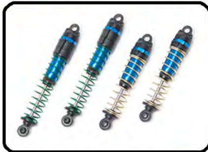
New blue anodized aluminum V2 coil-over shocks