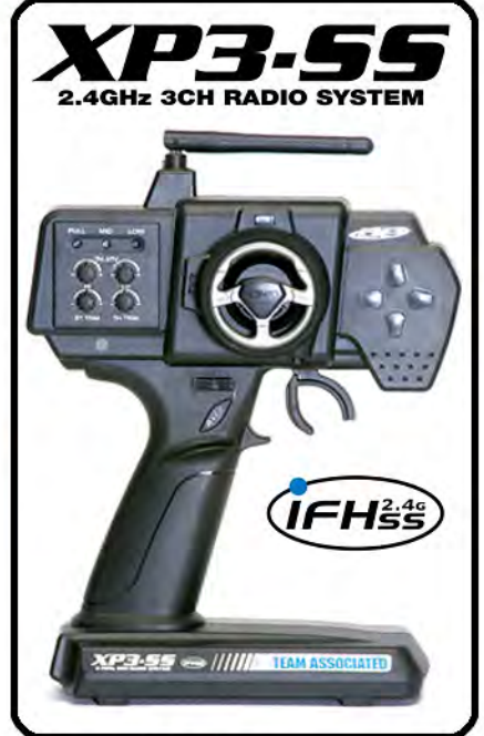
XP3-SS 2.4GHz 3-channel radio system