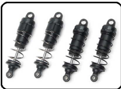
Huge 16mm Big Bore shocks