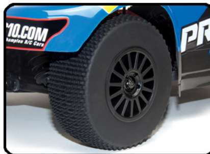
15-spoke offroad hex drive wheels with high-grip racing tires