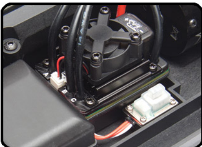
Reedy SC800-BL brushless speed control with High Current T-plug Connector