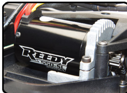
Reedy 550-SL 3500KV 4-pole brushless motor