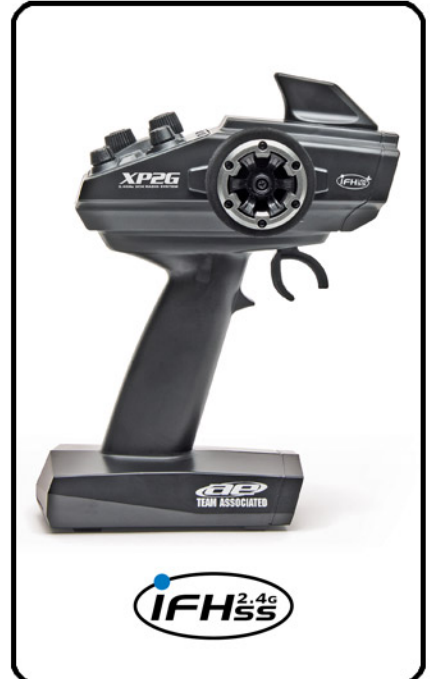
XP 2.4 GHz radio system