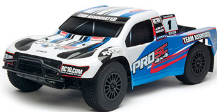
2 body color schemes to choose from