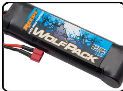
Reedy WolfPack 7-Cell 8.4V NiMH Battery with High Current T-plug Connector