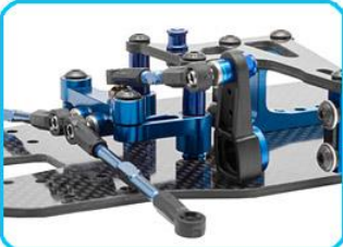
Updated dual bellcrank steering system and floating servo mount