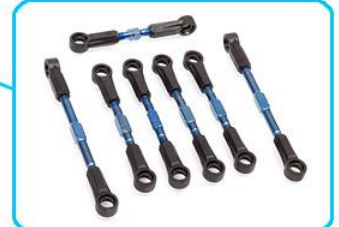
Titanium turnbuckles with turnbuckle eyelets for easy access to ball stud for adjustment