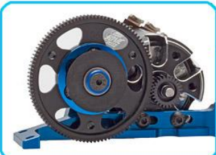
New one-piece motor mount