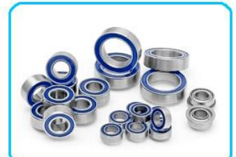
22 precision ball bearings

RC10TC7 FT Kit shown equipped with items NOT included in kit: Reedy motor, Reedy battery, Reedy ESC, servo, receiver, and pinion gear. Body, wheels, and tires are not included. Assembly and painting required.