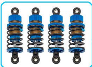
FOX® shocks with Genuine Kashima® Coat