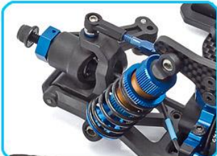
Updated suspension geometry