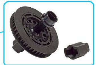
Front spool with replaceable composite outrdrives