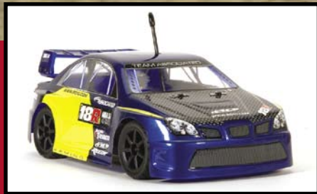
► AE Kamino