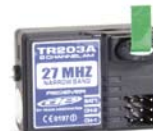
Receiver and motor installed