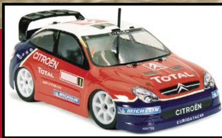
► Citroën XSARA WRC 2005