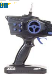
XPS radio with servos installed