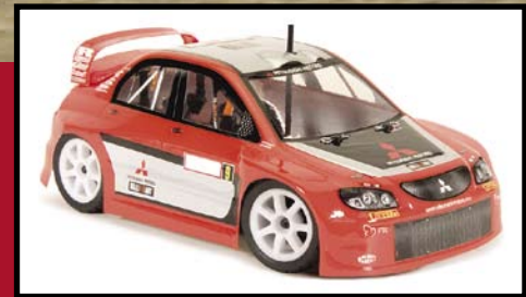
► Mitsubishi Lancer WRC05