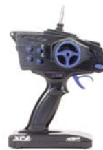
2-Channel Radio with all servos