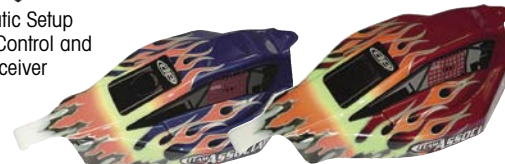
Choose from 2 paint schemes