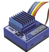
Automatic Setup Speed Control and XPS Receiver