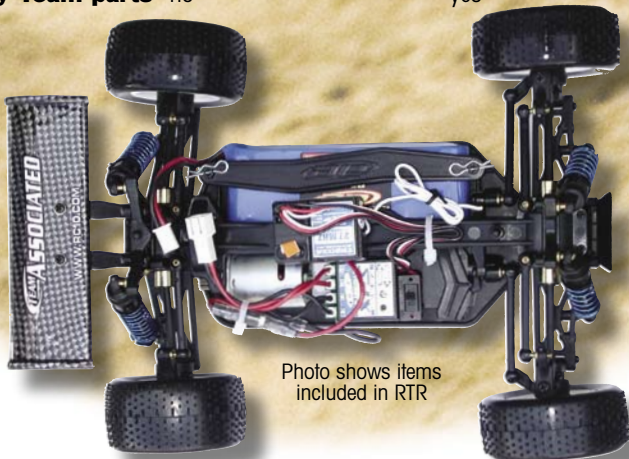
Photo shows items included in RTR