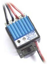
XPS speed control installed