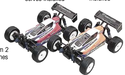
Choose from 2 paint schemes