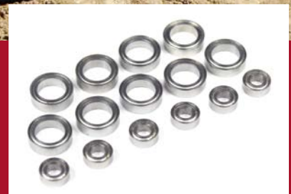
► Full Set of Ball Bearings