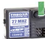
Receiver and motor installed