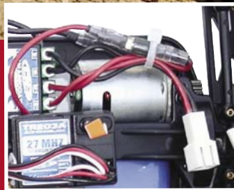
► Powerful "Super 370" Motor Installed