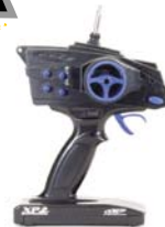
XPS radio with servos installed