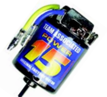
Photo shows items not included in TC4

• SEE WEB SITE FOR COMPLETE DETAILS AND HOUPS • www.RC10.com • www.TeamAssociated.com •