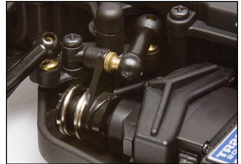
Newly designed servo saver.