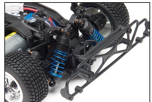
Fluid-filled shocks with adjustable ride height.