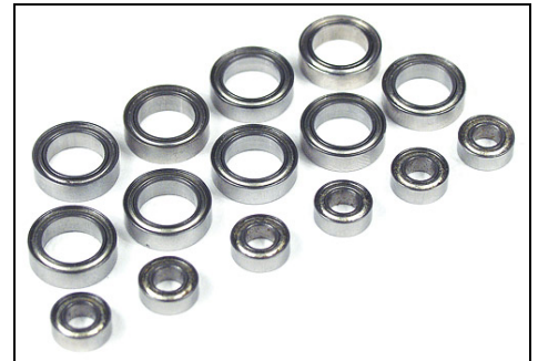
Precision ball bearing drive train.