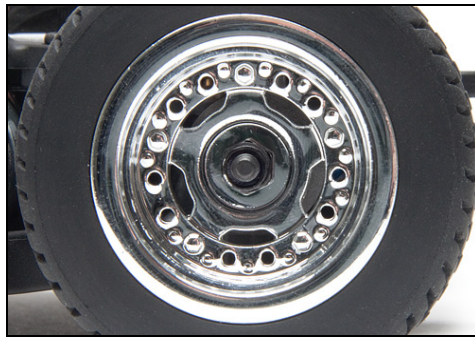
Chrome late model style wheels.