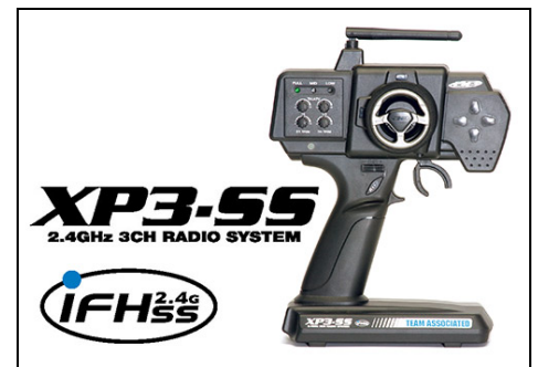
XP3-SS 2.4 GHz 3-Channel radio.