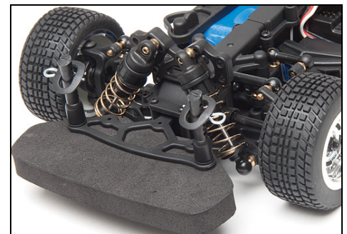
Durable foam front bumper.