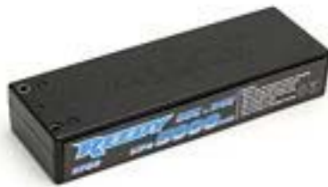
#709 Reedy LiPo 5000mAh 7.4V 35C battery

Associated recommends the following battery for maximum performance: