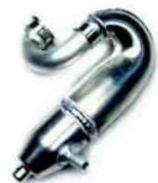
Dual-Chambered rear-exhaust manifold and pipe included in non-pull start Nitro TC3 Team kit #2035.