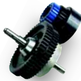
Shoe-type two speed transmission