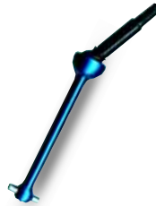
Factory Blue MIP CVD's