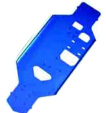
Factory Blue Aluminum Chassis