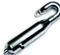
Side-exhaust manifold and pipe included in pull-start Nitro TC3 Team kit #2034.