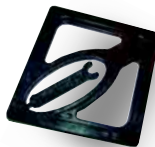
Setup Tool for track width, caster, camber & ride height