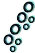
Rubber sealed ball bearings