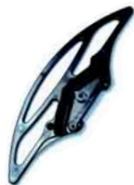
New design impact-resistant front bumper