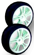
Pro-Line V-Rage Tires on "Gumby" Wheels