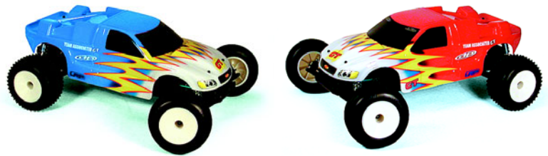
Painted Pro-Line F150 body included!