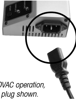
For 120VAC operation, use the plug shown.