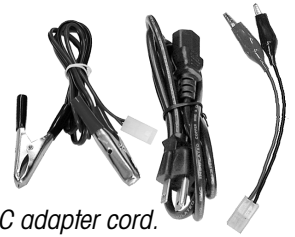
Left: DC adapter cord. Middle: AC cord. Right: Alligator clip adapter

WARNING! To avoid overheating, never place charger and/or battery pack in direct sun light while charging.